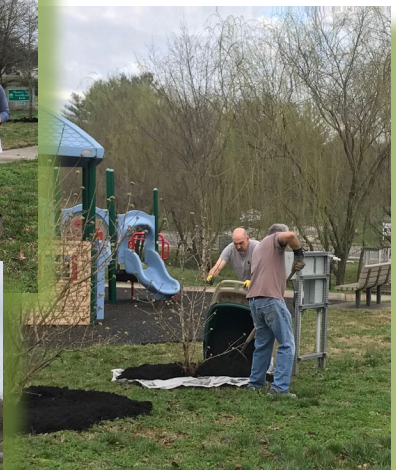
Volunteers break out the rakes and shovels at Tank Strickland Park, February 24, 2018.